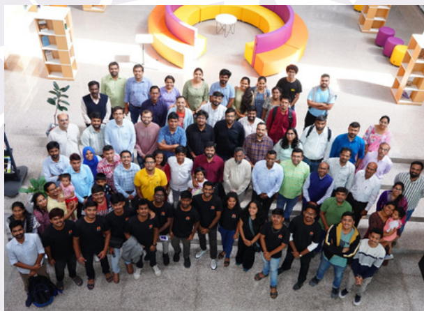
Glimpse of Annual Alumni Day 2024

IIT Hyderabad continues to strengthen its alumni and industry engagement in line with its global and inclusive vision. With a growing alumni base of over 8,000+ the institute is preparing to launch new regional chapters in Japan, the Bay Area (USA), Europe and Singapore.